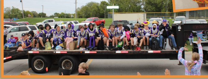
MS Football rode in the Homecoming Parade on October 6th.