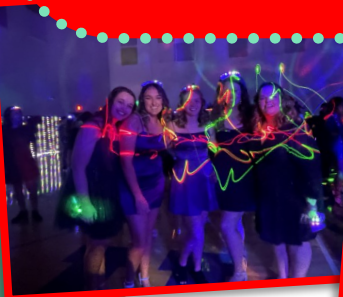
HS students had a ball at the Homecoming Dance!