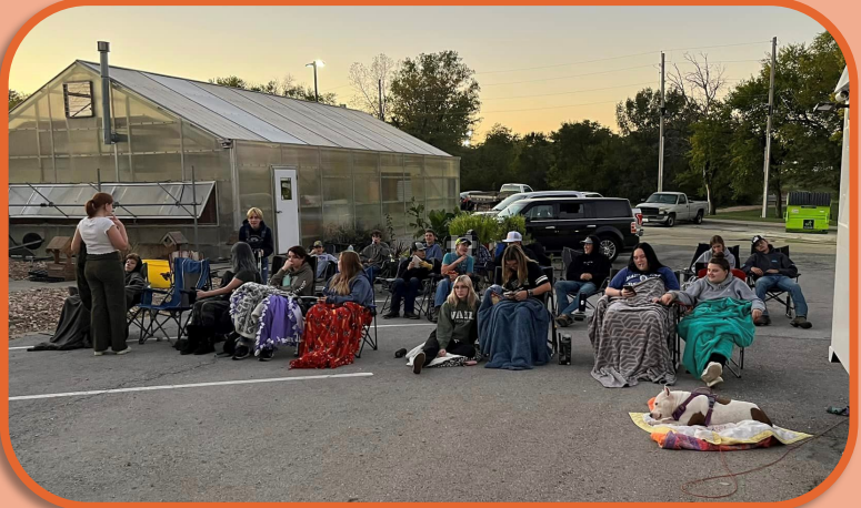
The HS FFA hosted a fun outdoor movie night on October 19th!

As always, thank you for your support! It's a great year to be a Rooster and Chick!