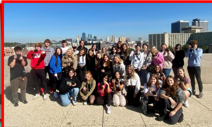
PHHS students enrolled in a photography class spent a day learning about aperture settings, along with shallow and deep depth of field techniques in downtown Kansas City.