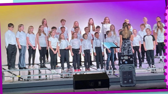
PHIS Choirs and Exploring Music students rocked the house!