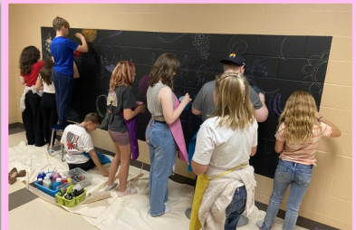
The Optimist Club recognized three Super Citizens (right) this month at the IS!