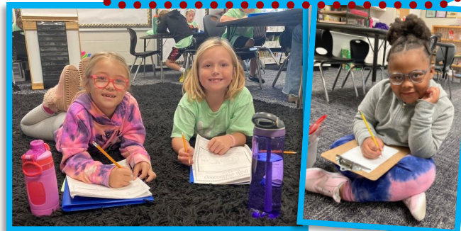
It's so fun practicing writing stories!