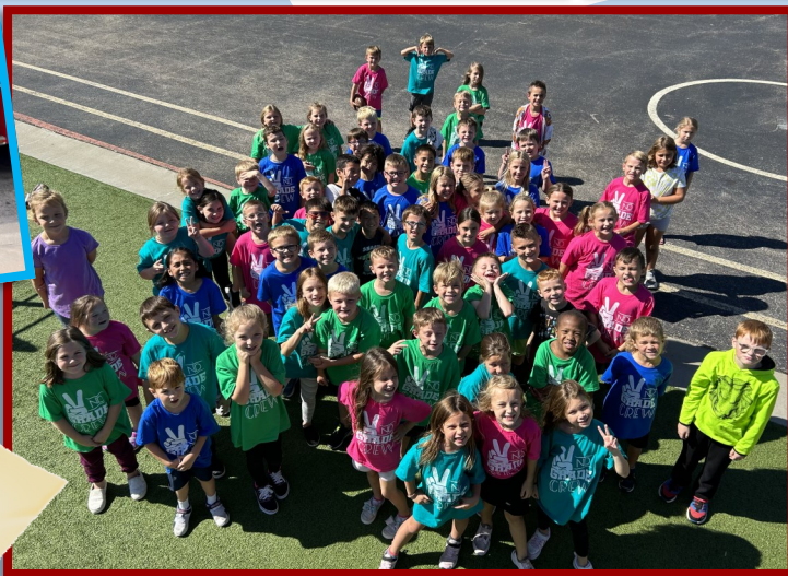
Second graders were excited to show off their class shirts!