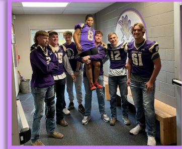
Senior Rooster football players came to read with the students at the ES!