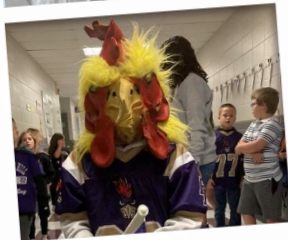
The PS had a great time dressing up for Homecoming Week!