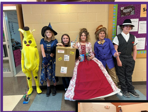
Above: Winners of the PHIS Student Council costume contest! How fun!