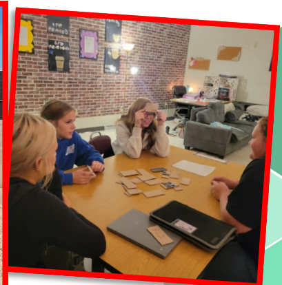
Child development students have been testing their knowledge with the age appropriate games they made in class.