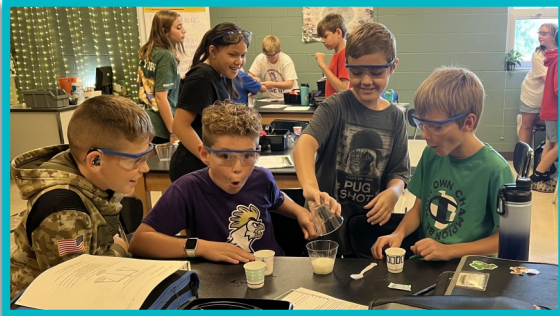
Mrs. Glazner's class did an experiment to find out what a chemical change was. They mixed solids and liquids together and discovered that they created a gas when there was a chemical change!