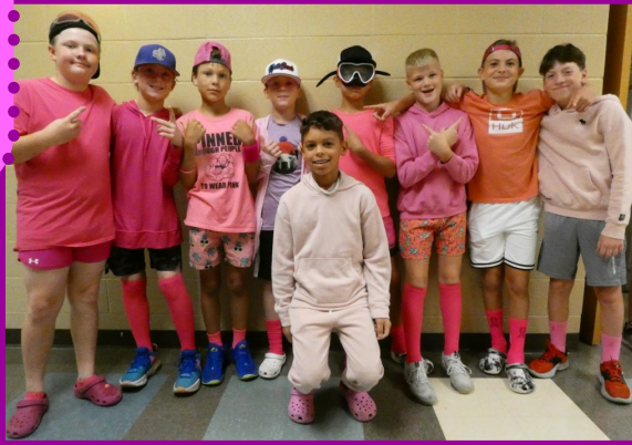
Fifth and sixth graders had a great Homecoming Week!