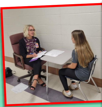
Students in Exploratory FCS classes worked with PH admin to practice their interview skills.