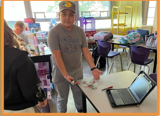
The MS offers a variety of fun clubs for its students! Pictured above: History, Engineering, and Art!