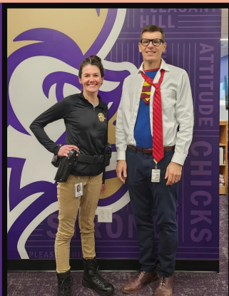
Barbies, Pac-Man, The Wizard of Oz, Superheroes and Expo Markers, Oh My! All in the hallways of PHES!