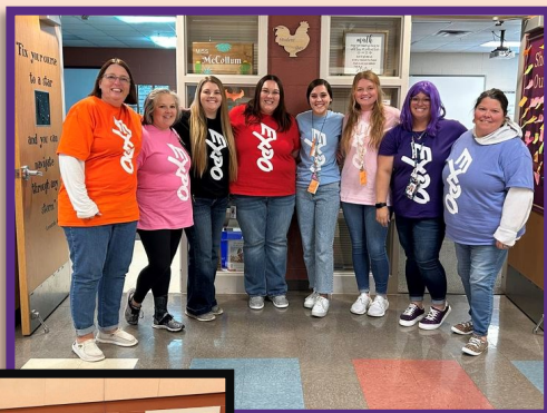
Above: PHIS fifth grade teachers are the sharpest team around!