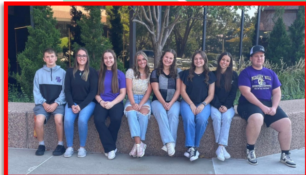
Yearbook Staffers attended the Walsworth Artist Session to work with a graphic designer to design the next yearbook cover.