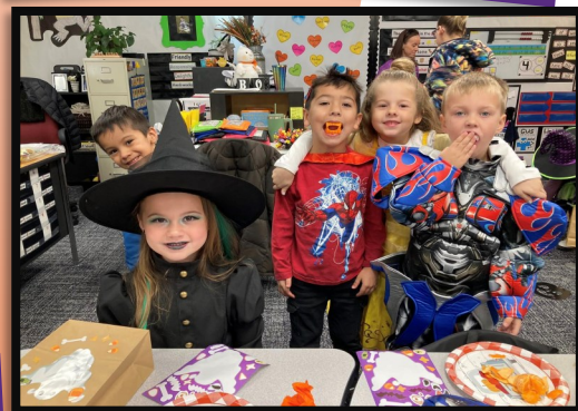
Above: Halloween parties were a big success at PHPS!