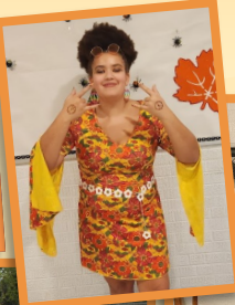
The Fall Dance was a big success!